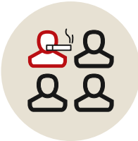
Tobacco & chronic disease