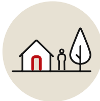
Racism, health equity & social determinants of health